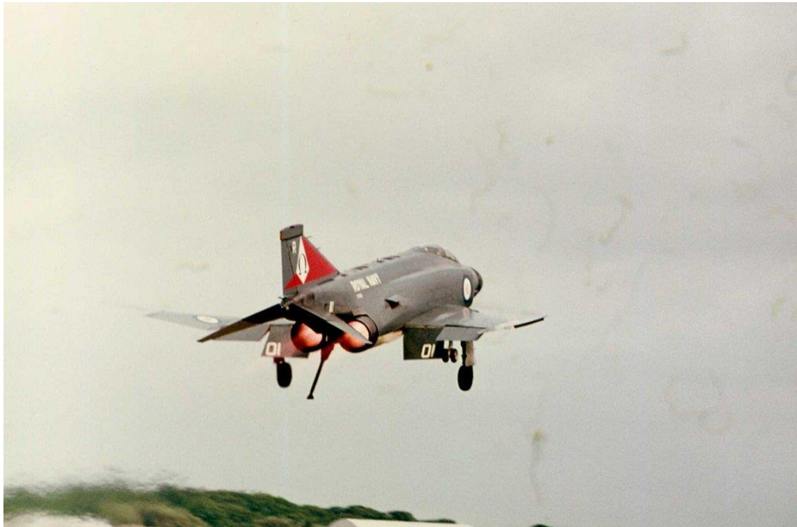
Phantom FG1 XT863 on practice `go-round` over Runway 17 circa July 1974